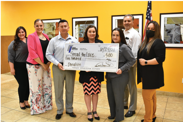
Casual for a Cause check presentation to Spread the Love charity in June.

We are excited to announce that a robust phone system will soon be implemented that will facilitate members with assistance through the Contact Center and provide internal process improvement for routing calls. The enhancements the new phone system is grounded on being able to provide the best communication options for our members. Our main line phone number will remain the same at 760-352-1540, option 0. The latest updates will be posted on ficu.com so be sure to be on the lookout for more information!