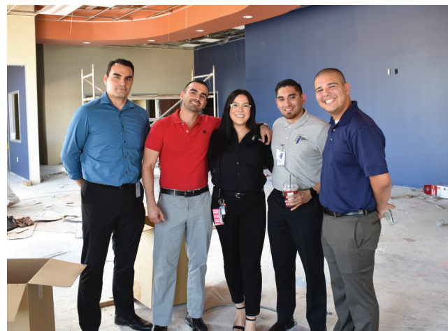
Our newest #TeamFICU personnel visits our new Calexico Branch that is set to open early Fall at the intersection of Cole Blvd. and Rancho Frontera.

Visit our website or social media to view the latest video featuring Home Equity Line of Credit (HELOC) .