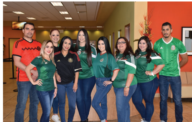
The El Centro branch in high spirits for the start of the 2018 World Cup.