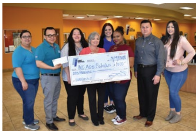
FICU donates $1,000 to the IVC Ace Scholars program which supports former foster youth with college expenses.

Thank you for your membership and loyalty, we look forward to continuing to serve you for many years to come.