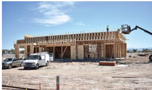
Construction continues for our new Calexico Branch which is set to open in early Fall at the intersection of Cole Blvd. and Rancho Frontera.