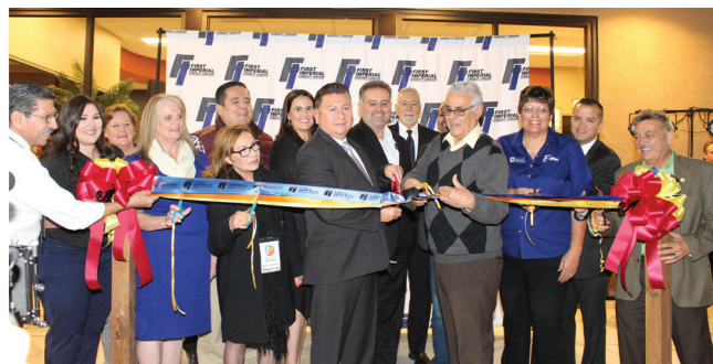
Calexico Ribbon Cutting ceremony held in December in the presence of our Board of Directors, City of Calexico Mayor and Council Members, community partners, members and staff.